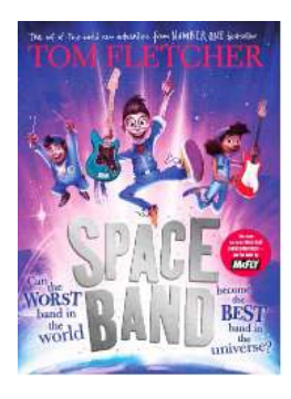
Year 3 & 4