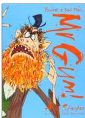
Years 3 and 4