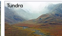
Different examples of biomes