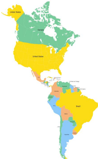
A map of the Americas containing North and South America and the sub-continent of Central America