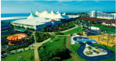
Sir Billy Butlin (1899 – 1980)