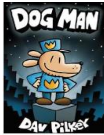
Key Stage 1

Please see below for this week's reading recommendations: