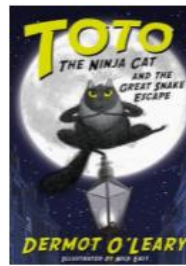
Key Stage 2