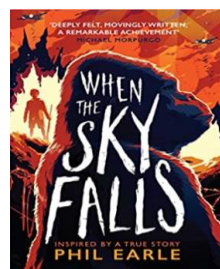
Key Stage 2